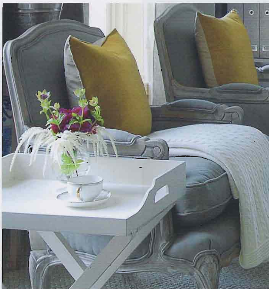
Folding Chantarelle butler's table, €125

One of the first things I love to get started on is changing the cushion covers. It only takes ten minutes yet it transforms the mood of the room dramatically