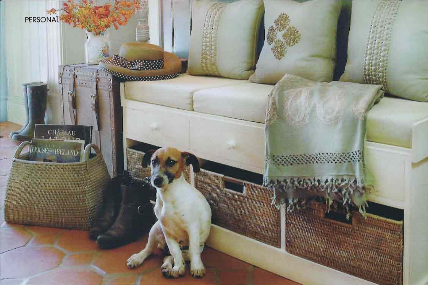
Bilberry hall bench, €550, and Rattan baskets, €40 each

watercolour gets replaced with a vivid oil painting of a plump aubergine. I have definitely found that bringing out a new Hedgeroe catalogue in spring and again in autumn helps to show how our furniture adapts to the changing seasons. Our website also has a section called "Create the Look" to help give even more ideas and we also host design workshop evenings at Christmas and Easter.