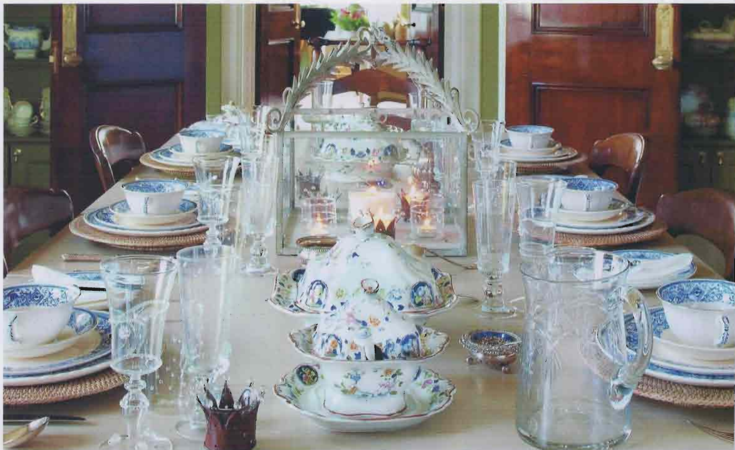
Plantation table, €1,335, sits up to 18 guests

As autumn's evening light fades, I have once again found myself retreating to the sanctuary of the sitting room. Perhaps a natural nesting instinct, common to us all, has me bringing the big basket in from the shed to fill with logs and longing for the smell of wood smoke on dusky evenings. The need to create a cosy, warm and restful retreat becomes strongest at this time of year and "re-feathering our nest", so to speak, is as easy as it is natural to do. Even choosing the name 'Hedgeroe' for my shop was inspired by observing nature evoking change in our own moods. One of the first things I love to get started on is changing the cushion covers. It only takes ten minutes yet it transforms the mood of the room dramatically. Off with the cotton stripes and on with the wool and chenille. Strong rich colours are perfect and embroidery adds depth and texture. I also swap the artwork around; a favourite seaside