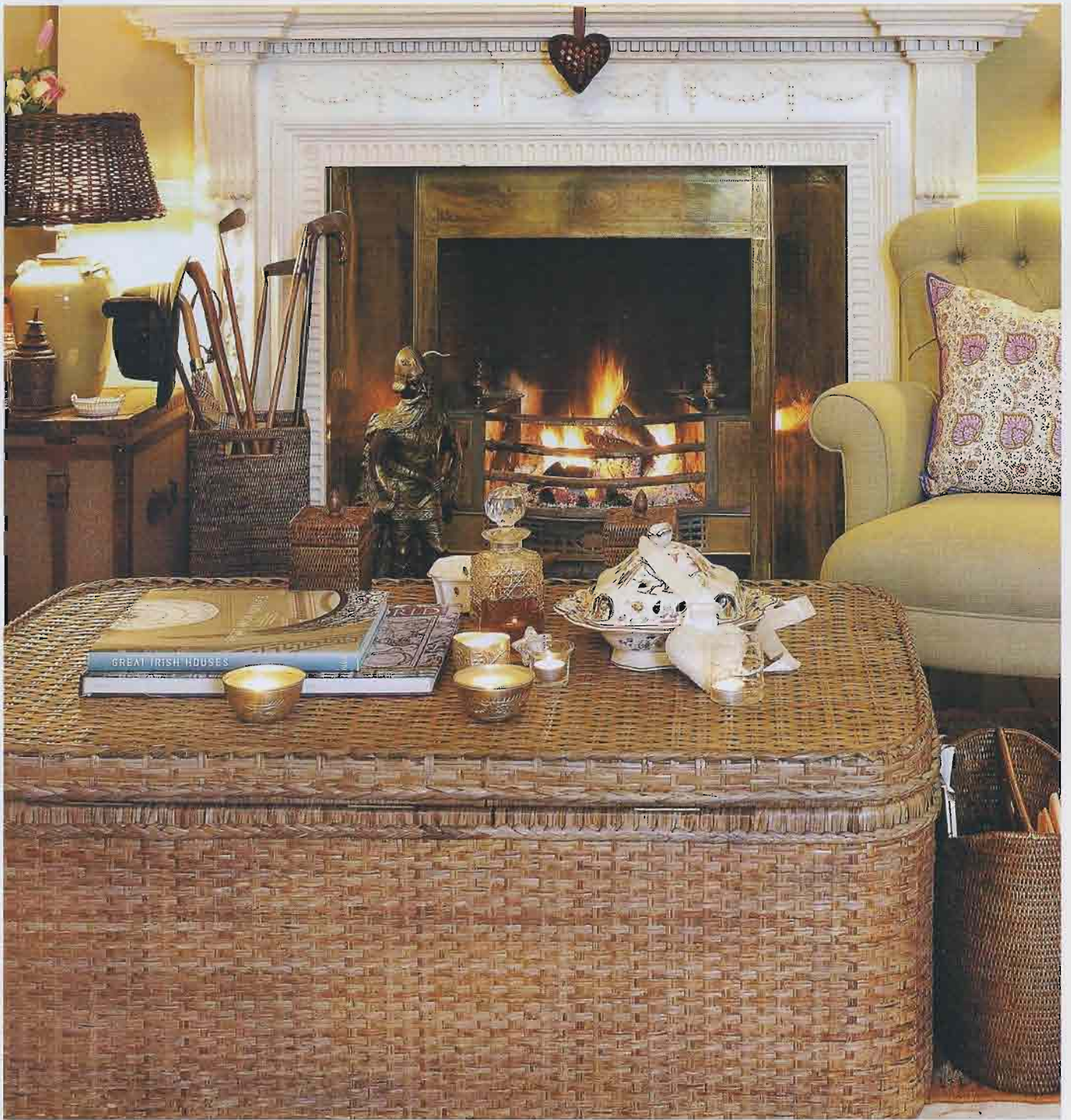
Rattan coffee table, €235