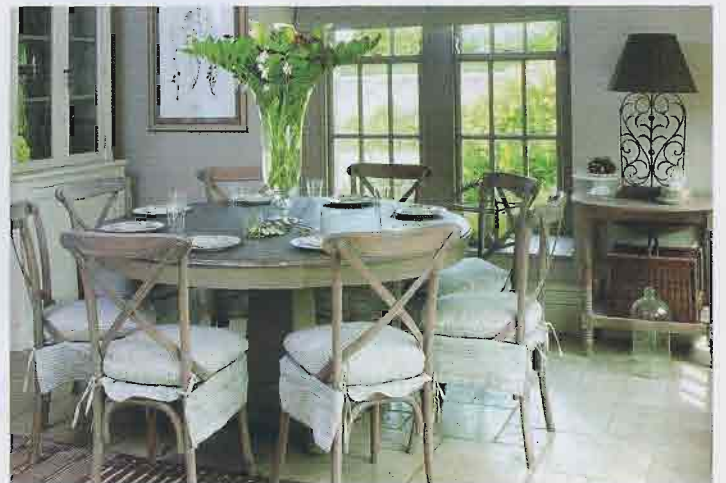
Above: Wilkam drop leaf table, €1,035, with Ciara cotton strip chairs, €238 Left: Rattan log basket, €38, Iwan chest, €165