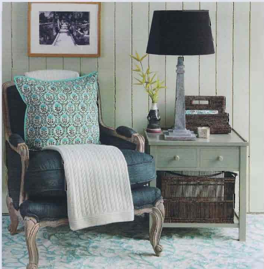
Riviera armchair, €575, Becca lamp, €70, and Becca side table, €220

Another must is a big coffee table; there should be enough room for candles, a jug of winter foliage, teapot, cups and plates for sandwiches. I know this may be rather indulgent, but I use a large rattan chest as my summer occasional table which gets stored away and replaced by the Hedgeroe 'William' coffee table once autumn arrives. This table can even take on a bunch of teenage boys using it as a resting place for tired feet in hiking socks as they curl into the sofa for a Saturday movie. Mostly, it is tweaks and little changes which reinvent my sitting room; a couple of extra table lamps and the log basket really do pull it all together. Candles which send their aroma of cinnamon and ginger around the rooms really give a feeling of wellbeing. ■